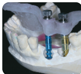
Positioning Implant Analogs With A Surgical Guide