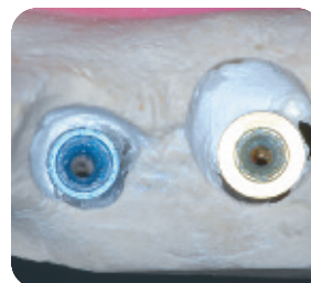
Analogs Secured In A Master Cast