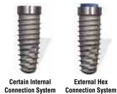
Certain Internal Connection System

Certain® Internal And External Hex Connection Tapered Implants Using Quad Shaping Drills (QSD's) And Tapered Implant Depth/Direction Indicators (NTDI's)